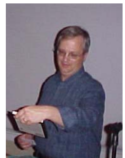
←----- Raffle Prize Winners -----→