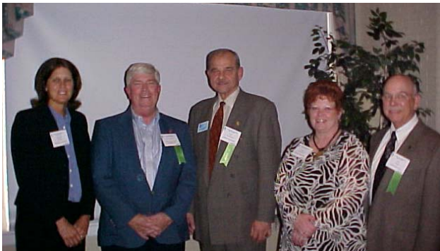
The Lincoln Foundation Team