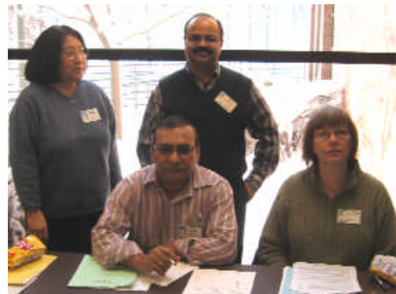
Some of our hard-working exam proctors.