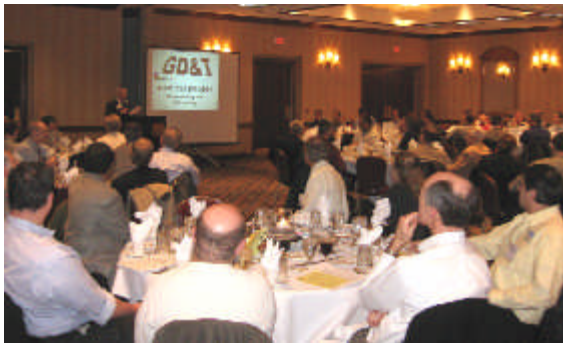
The new meeting location in Alsip was well-attended.