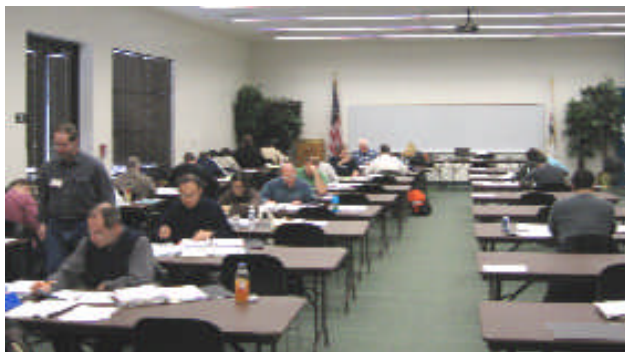
December ASQ Certification exams at the new exam site.