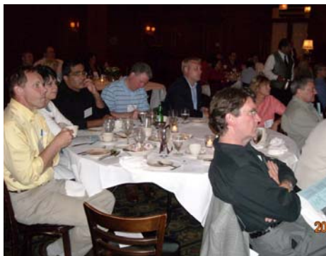
Section participation is key!