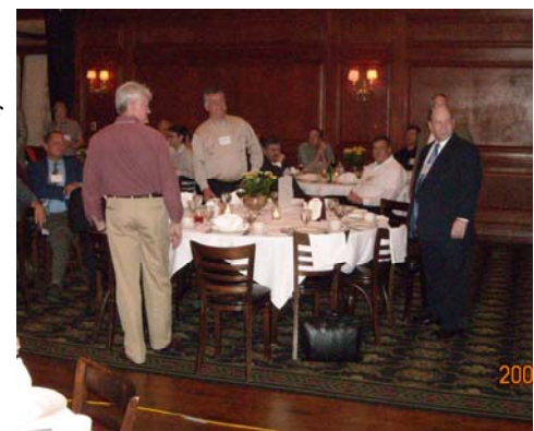
Introduction of Section Board members.